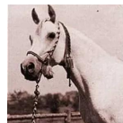
Fa Saana 1432