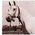
FADL 1930 AHR 896