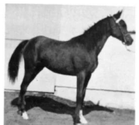
Turfara 1948 Bay