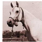
FADL 1930 AHR 896