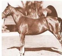
Rasafa 1926 Chestnut