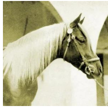
Antez 1921 Chestnut