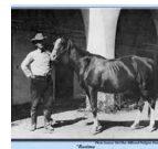
RASIMA 1917 GSB 694