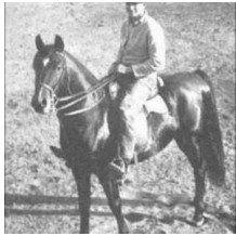
Oriental 1924 Bay