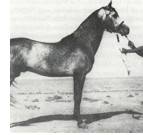
EL MOEZ 1934