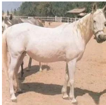
DAHMA II 1950 EOA 224 Grey