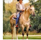
Hollywood Jac 86 1967