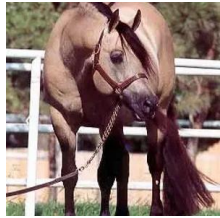
Hollywood Dun It 1983 Dunskin