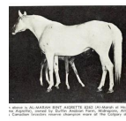
Al-Marah Bint Aigrette 1953