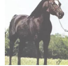
Nitez 1952 AHRA 0000