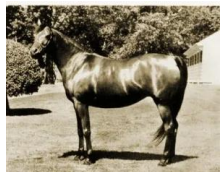
Gay-Rose 1957 Bay

GAY-ROSE 11891 Ferzan x Gali-Rose Gaihey Arabian Farms Iowa, Ester Park