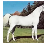
FERZON 1952 AHR 7723