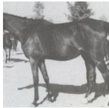
MONA 1956 Bay