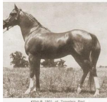
Kenur 1940 Chestnut