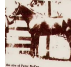
Dan Tucker 1887