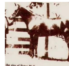
Dan Tucker 1887