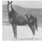
*DEYR 1904 AHR 33