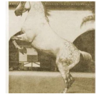
Raseyn 1923 Arabian Horse Association 597