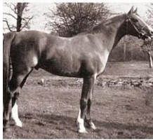
RIFARI 1956 Chestnut