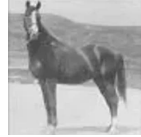
*DEYR 1904 AHR 33