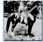
*HAMRAH 1904 AHR 28