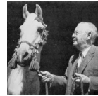
FAY-EL-DINE 1934 AHR 1170