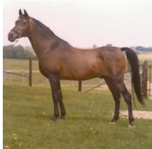
Fabah 1950 Bay