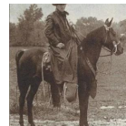
BINT BINT SABBAH 1930