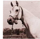
FADL 1930 AHR 896