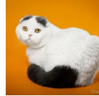
SGC, ECH Kalevalla-fold Va... 2010