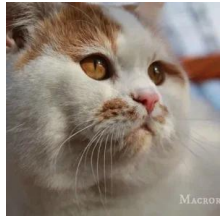
CH Macrory Mars 2013 Red Harlequin