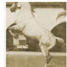
Raseyn 1923 Arabian Horse Association 597