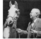
FAY-EL-DINE 1934 AHR 1170