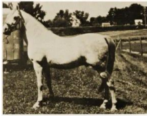
Gabbar 1950 Grey