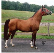
Neman 1973 Bay