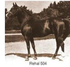
REHAL 1923 AHR 504