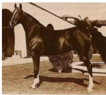
RABIYAT 1926 Bay