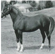
GULASTRA 1924 Chestnut