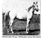
RIFAGE 1946 AHR 1286