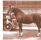
Radi 1925 GSB 0000