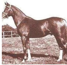
RISSALIX 1934 Chestnut