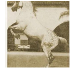
Raseyn 1923 Arabian Horse Association 597