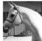
BINT NEFISAA 1959