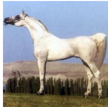
EL HILAL 1966 Grey