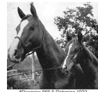
*RASMINA 1928 AHR 856