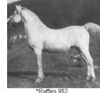
RAFFLES 1926 AHR 952