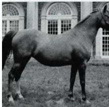
Risslina 1926 Chestnut