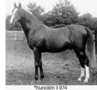
NUREDDIN II 1911 AHR 974