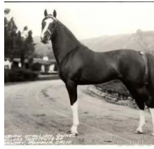
Rifnas 1932 Chestnut