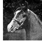
NASIK 1908 AHR 604