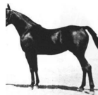
Bint Sabah 1925 RAS 135