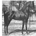
IBN RABDAN 1917 RAS 86