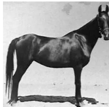
LAYLA 1929 Chestnut