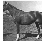
Malpia 1958 RASB 1349