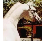
Salon 1959 RASB 1412