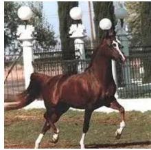
Muscat 1971 AHR 177179 Chestnut