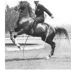
HANAD 1922 AHR 489