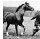
Berk 1903 AHR 343