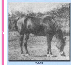
Tahdik 1920 Bay